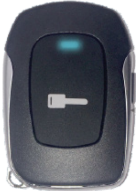
↑ Micro USB Charging port

Your handheld remote control contains a long-lasting Li-Ion battery that can be recharged with a micro-USB cable (supplied). It is recommended that the battery be fully charged before the first use for maximum efficiency and range. During normal operation, the battery will last for approximately 1 month before recharging is required.